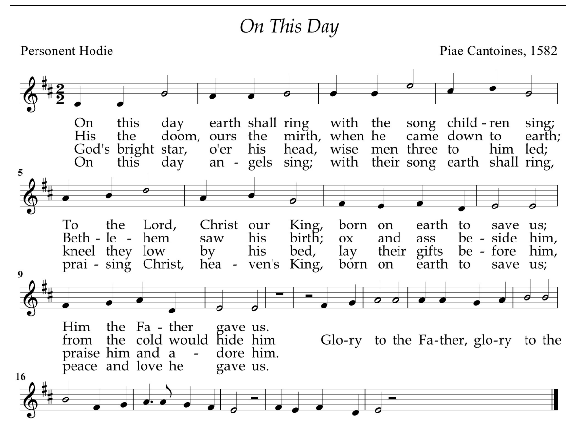
Son, Glo-ry to the Ho-ly Ghost, to the three in one.