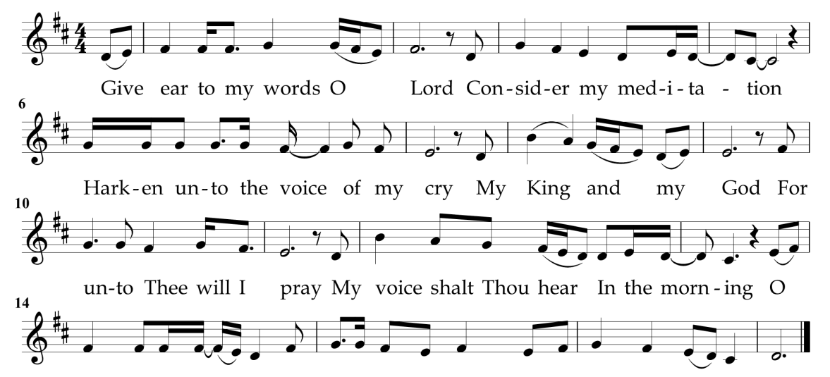
Lord in the morn-ing Will I di-rect my prayer Un-to Thee and will look up